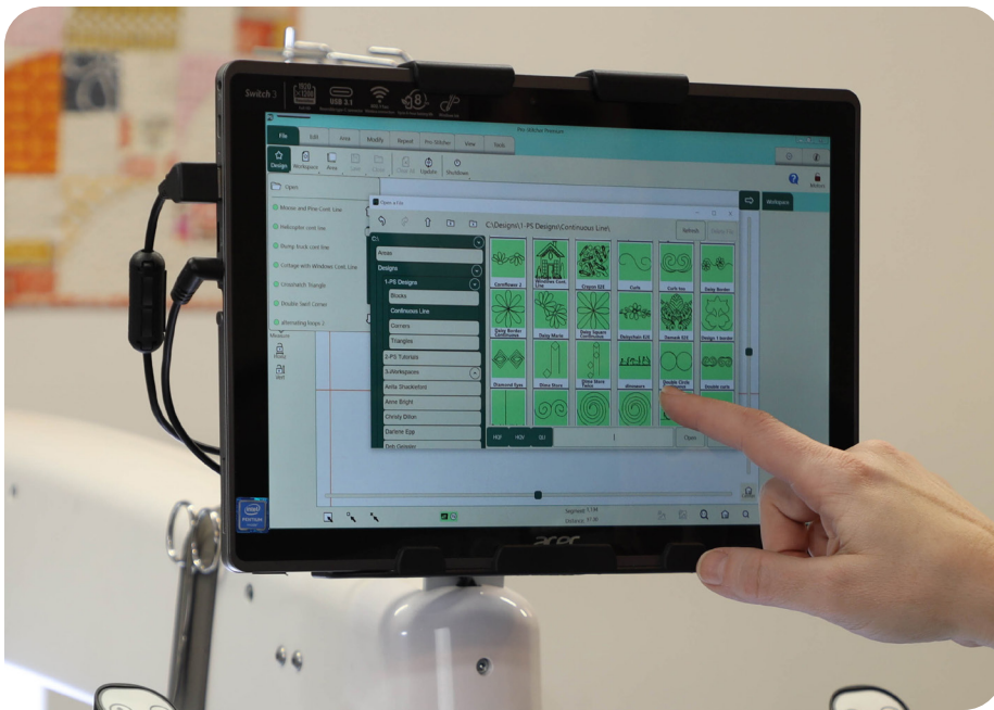
Pro-Stitcher Premium shown on one of many compatible machines.