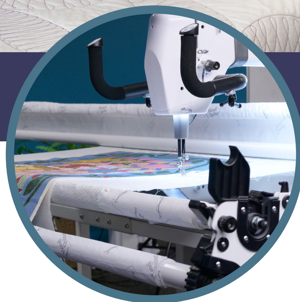
EASILY UPGRADEABLE TO A FRAME MOUNTED MACHINE