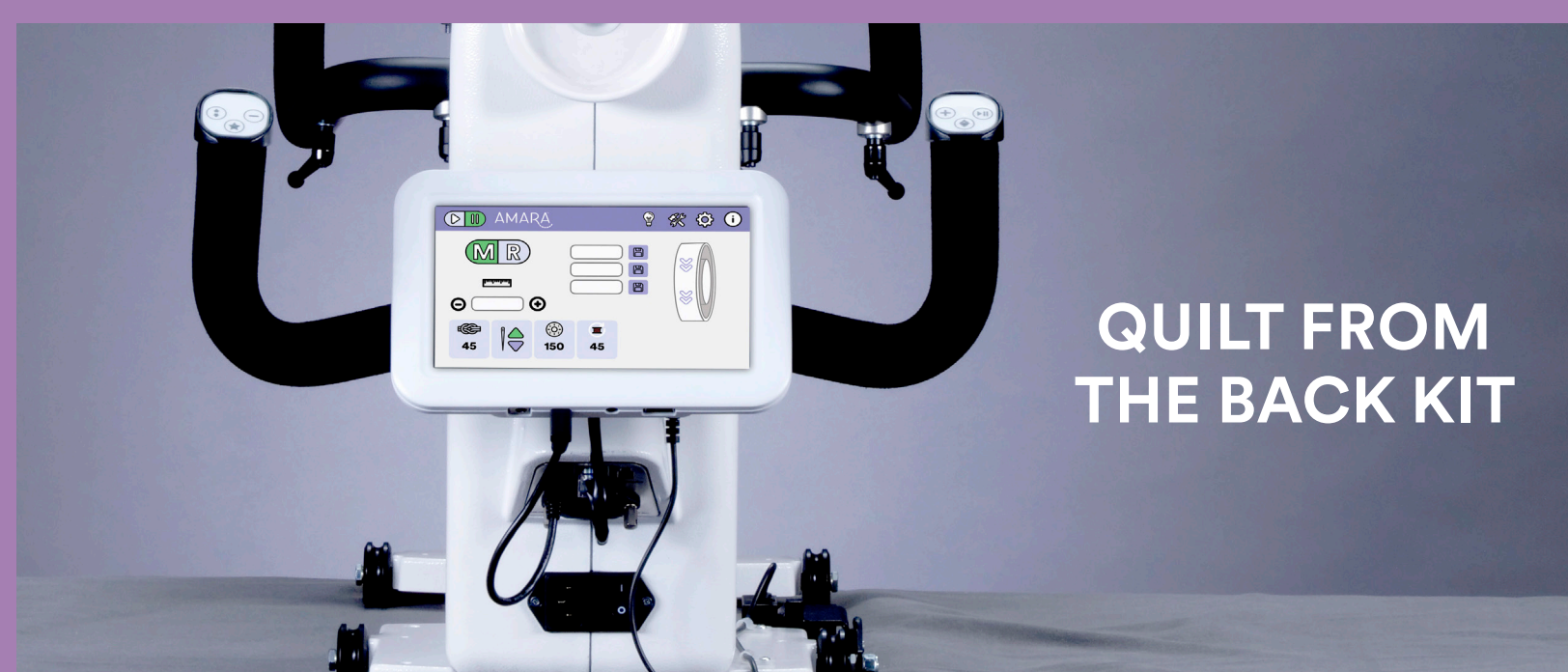
QUILT FROM THE BACK KIT