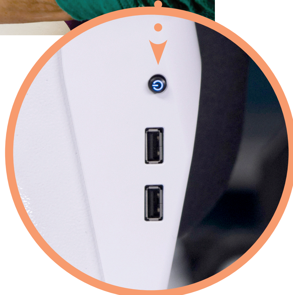
FRONT POWER SWITCH AND USB PORTS