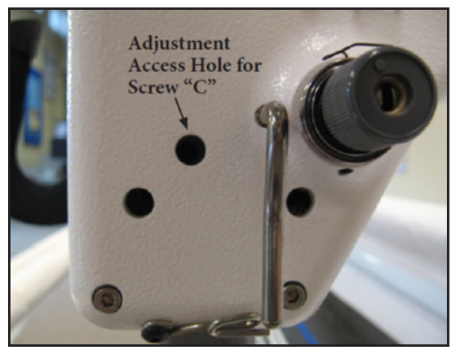
NOTE : Screw C is towards the top of the access hole.

Place the end of the 3mm hex tool through the adjustment access hole (labeled C in the photograph) and loosen the screw by turning it counterclockwise.